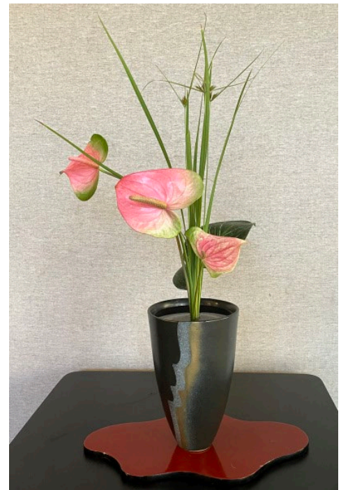
Figure 3: Ikenobo Shoka Shimputai by May Hiraoka-Tomita