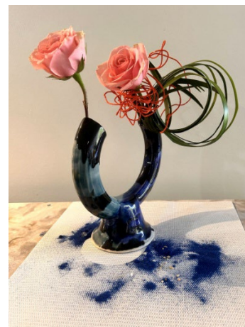
Figure 1: Sogetsu Emotion of One-sided Love by Yukari Sato