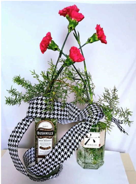
Figure 9: Sogetsu Wishful Love by Tim Donahue