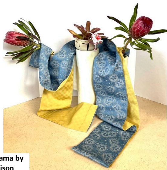
Figure 5: Sogetsu Drama by Charmaine Yee-Hollison