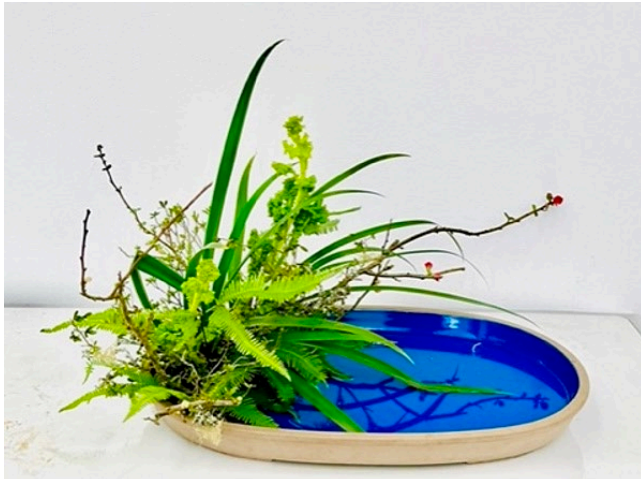
Figure 4: Ohara Landscape Moribana by Grace Sekimitsu

Thank you for reading this. Friendship through flowers