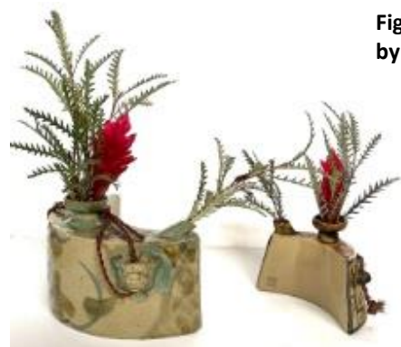
Figure 6: Bindachi arrangement by Charmaine Yee-Hollison