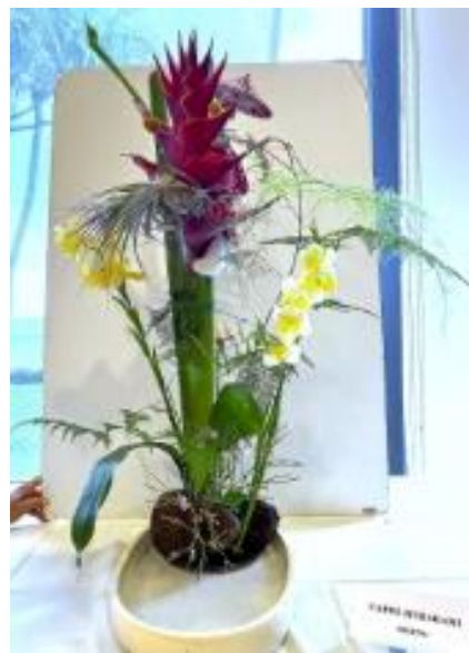
Figure 4: Exhibit arrangement by Carol Murakami