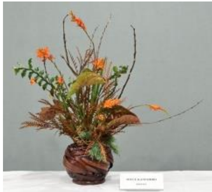
Figure 1: Sogetsu Free Style by Joyce Kaneshiro