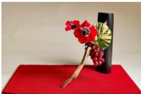
Figure 13: Jeanne Houlton's arrangement using anemone