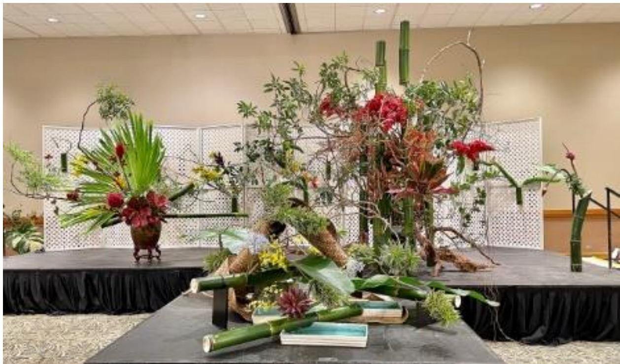
Figure 10: photo by Jeanne Houlton