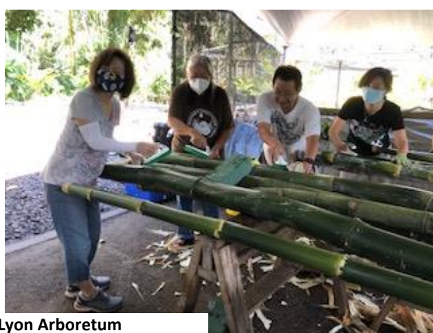
Figure 3: Prepping bamboo at Lyon Arboretum