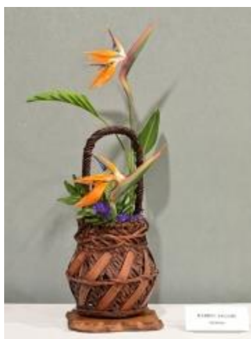
Figure 9: Ikenobo Free Style by Darryl Tagami