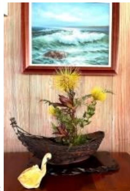
Figure 12: Charmaine Yee-Hollison's Sogetsu Free Style Cormorant Fishing