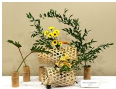
Figure 8: Ichiyo Free Style by Iwalani Barbazon